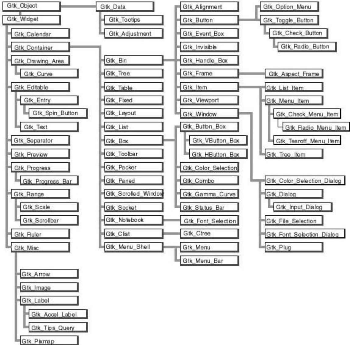
Fig. 1: Widgets Hierarchy